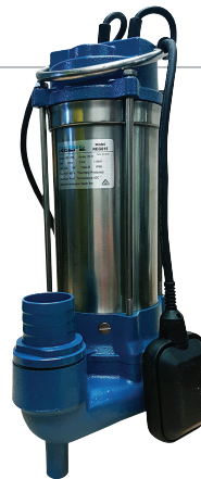
REEFE Submersible Pump (REG015)