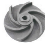
Cast Iron Impeller Components