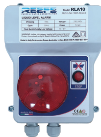
REEFE Liquid Level Alarm (RLA10)