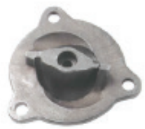
Stainless Steel Grinder Components